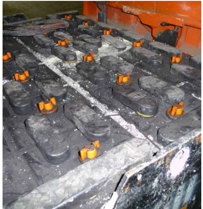
Figure 2: Example of lead acid battery corrosion