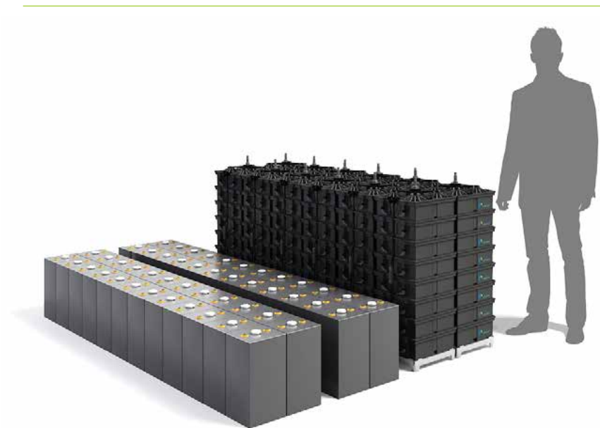
Figure 3: Side-by-side comparison of gel lead acid (grey) and the S20-008F (black) for a 22 kWh application

Table 1 shows a head-to-head comparison of Aquion and lead acid batteries. The gel lead acid battery chosen for this model is well regarded and prevalent in this type of small-scale solar system. This product is modeled alongside Aquion's S-Line Battery Stack in a 48 V system that requires 22 kWh (458 Ah) usable energy and operates in 30°C (86°F).